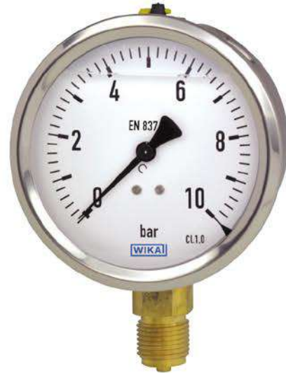
Bourdon tube pressure gauge, model 213.53.100, lower mount